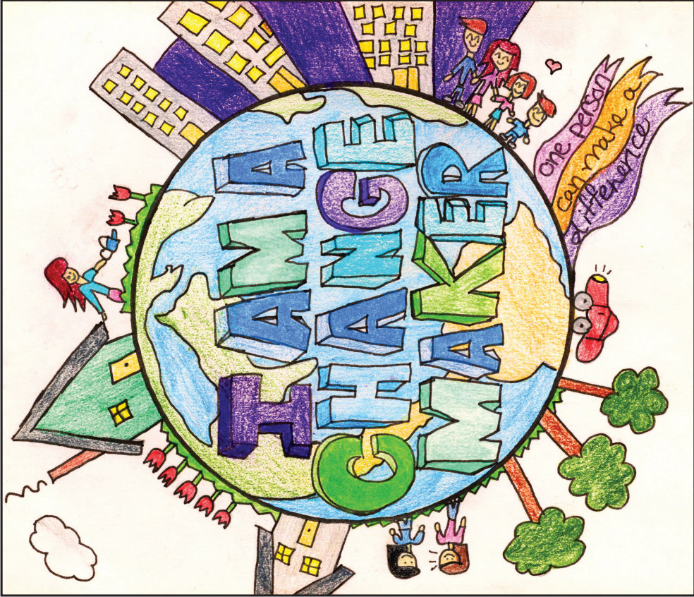
"I am a change maker" by Amy Shell 2013 Kids' Art Contest winner (Bennett Elementary, Bellevue)