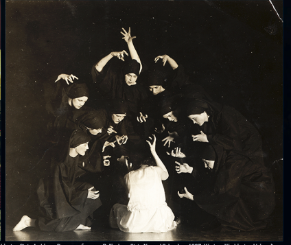
Left to Right: Aar's Dancing Clam in UDistric1 Seafair Parade, 2002. Women atop slabs of bacon creating world's largest omelet, Chehalis, 1951. Nessies at Scottish Highland Games, 2016. Dance performers, Bellingham State Normal School, ca 1927.