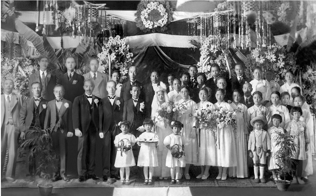
They changed into western-style clothes for another formal photo with the entire wedding party.