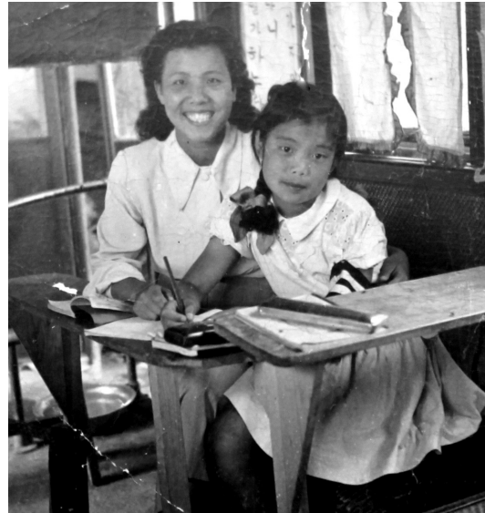
With her teacher in a streetcar schoolroom at Pusan during the war.

"I was an adventurous girl, always curious. I bought some whale meat, watched them gutting fish and unloading cuttlefish. On the way home, I always saw