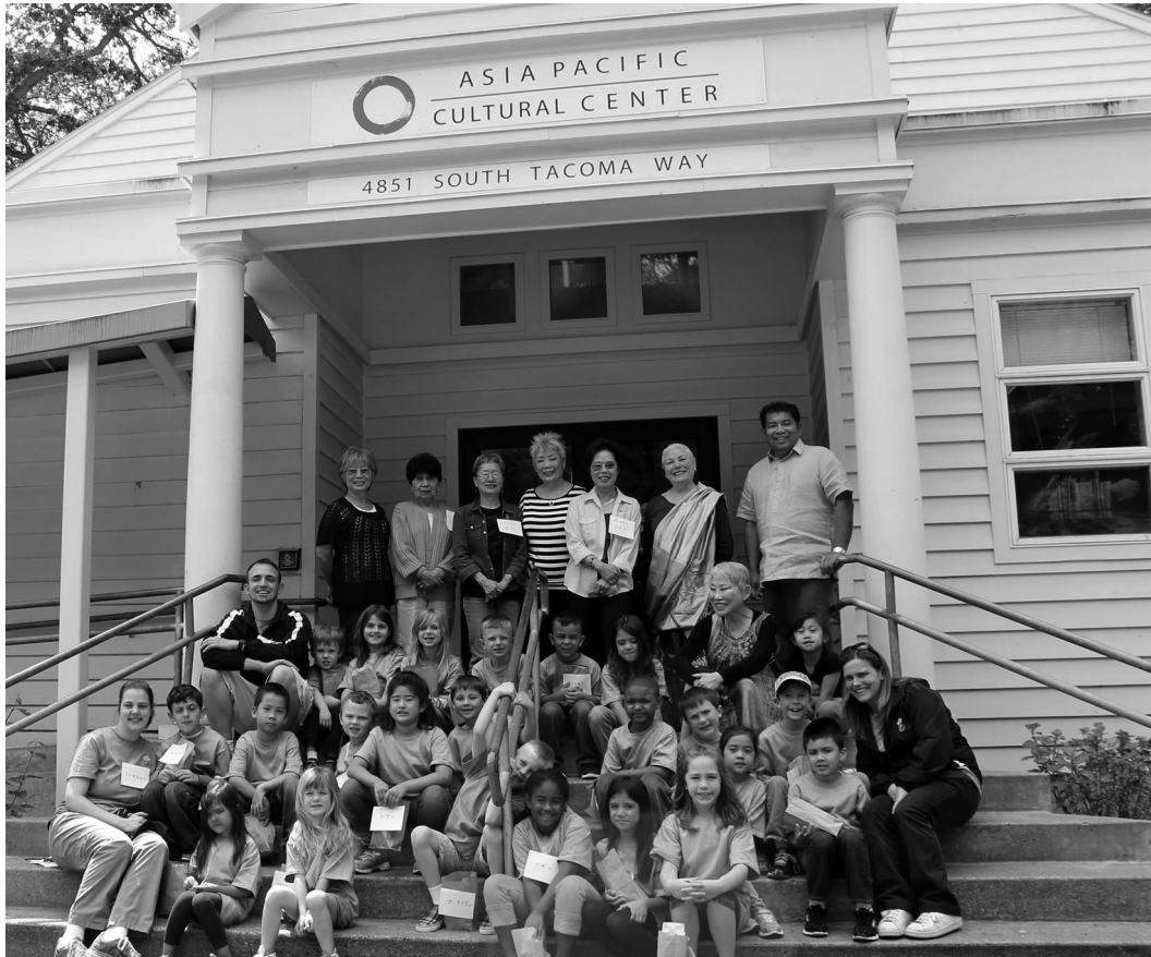
With students, staff and volunteers at the Asia Pacific Cultural Center.