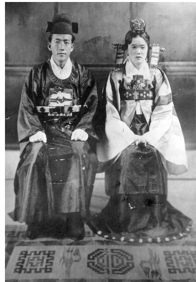
Her parents in traditional costume on their wedding day in 1936.