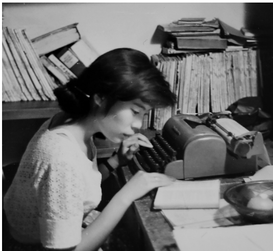
Practicing on an English-language typewriter in 1962.

Her enigmatic father now signaled he was proud of her gumption. One day when she awoke too sick to go to work, he called her manager in the house-