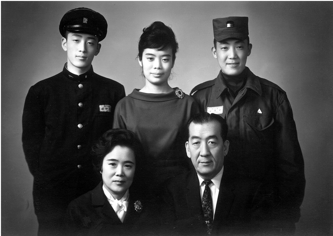
With her parents and brothers around 1961.

“Every time I had the opportunity to go beyond my neighborhood over the next year, I knew things were changing for the better. Streetcars were running. New buildings were being constructed. My mother rented the upstairs to a doctor and his family, while our living room was rented to a woman who was going with an American soldier. The small room where I used to play was rented to one of my schoolteachers who had taken in her mother and sister. It was a busy house. I liked that. We did not see father and we did not ask our mother where he was.”