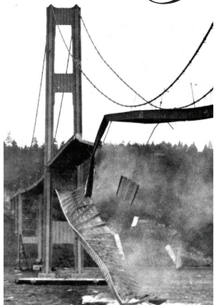
Tacoma Narrows Bridge collapse, 1940, Washington State Archives

In October 2009, WSHRAB announced its first-ever local regrant program for Washington's historical and genealogical societies, museums and historic homes, university and other archives, and similar groups.