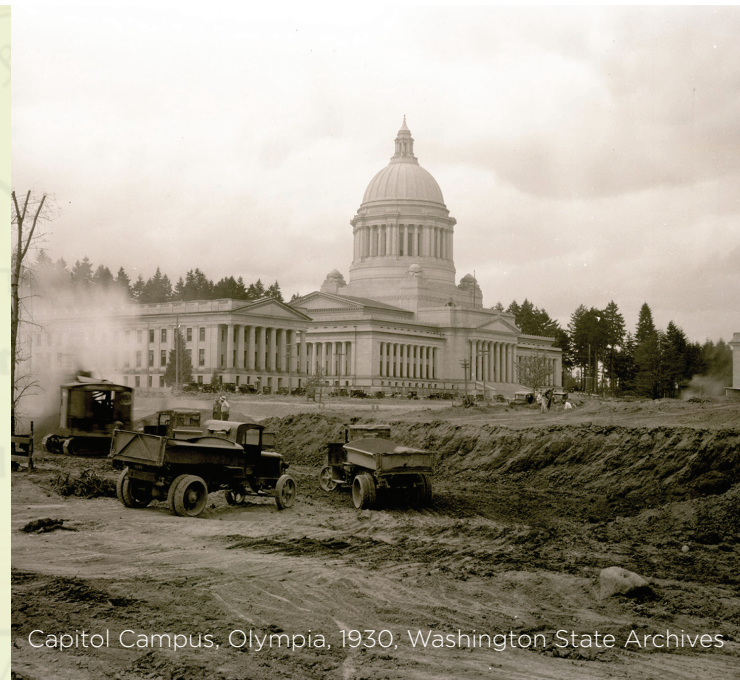
Capitol Campus, Olympia, 1930, Washington State Archives

Records document our rights as citizens and the laws that govern our lives.