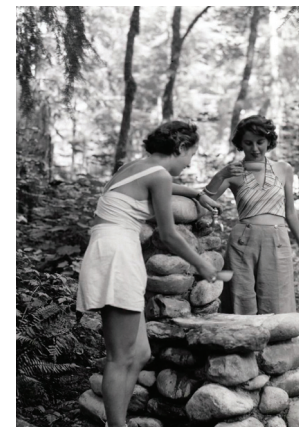
CCC Drinking Fountain, ca. 1930s, NARA- Pacific Alaska Region-Seattle

WSHRAB serves as a state-level review body and makes recommendations for proposals outlined in NHPRC grant program guidelines.