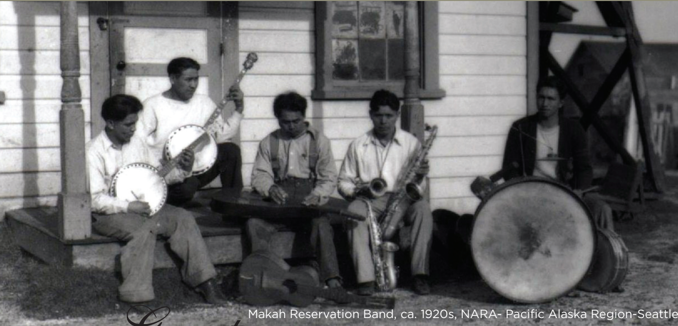
Makah Reservation Band, ca. 1920s, NARA- Pacific Alaska Region-Seattle

Learn more at www.digitalarchives.wa.gov/Archivesmonth